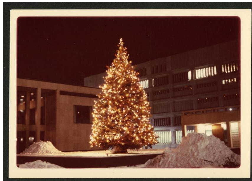
Christmas tree in front of City Hall, 1966.